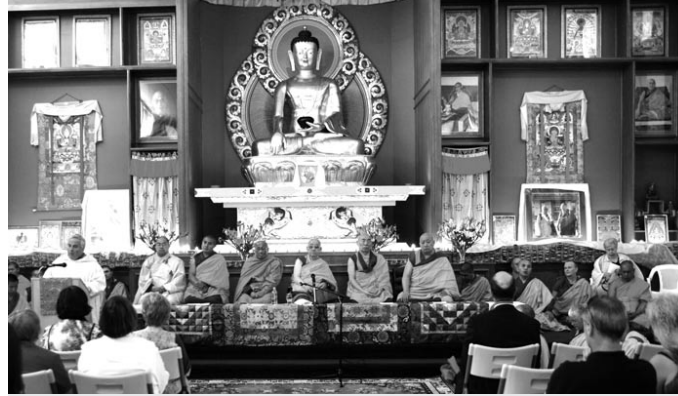
Monks and nuns from many traditions join prayers for international peace and harmony in the traditional Tibetan temple.

All teachings will be held in the rare and spectacular traditional Tibetan temple with its rich and ornate decorations, containing many treasures of Buddhist art, including an 18 foot golden statue of Shakyamuni Buddha. Regular temple tours provide an opportunity to learn about the temple's many external and internal features.